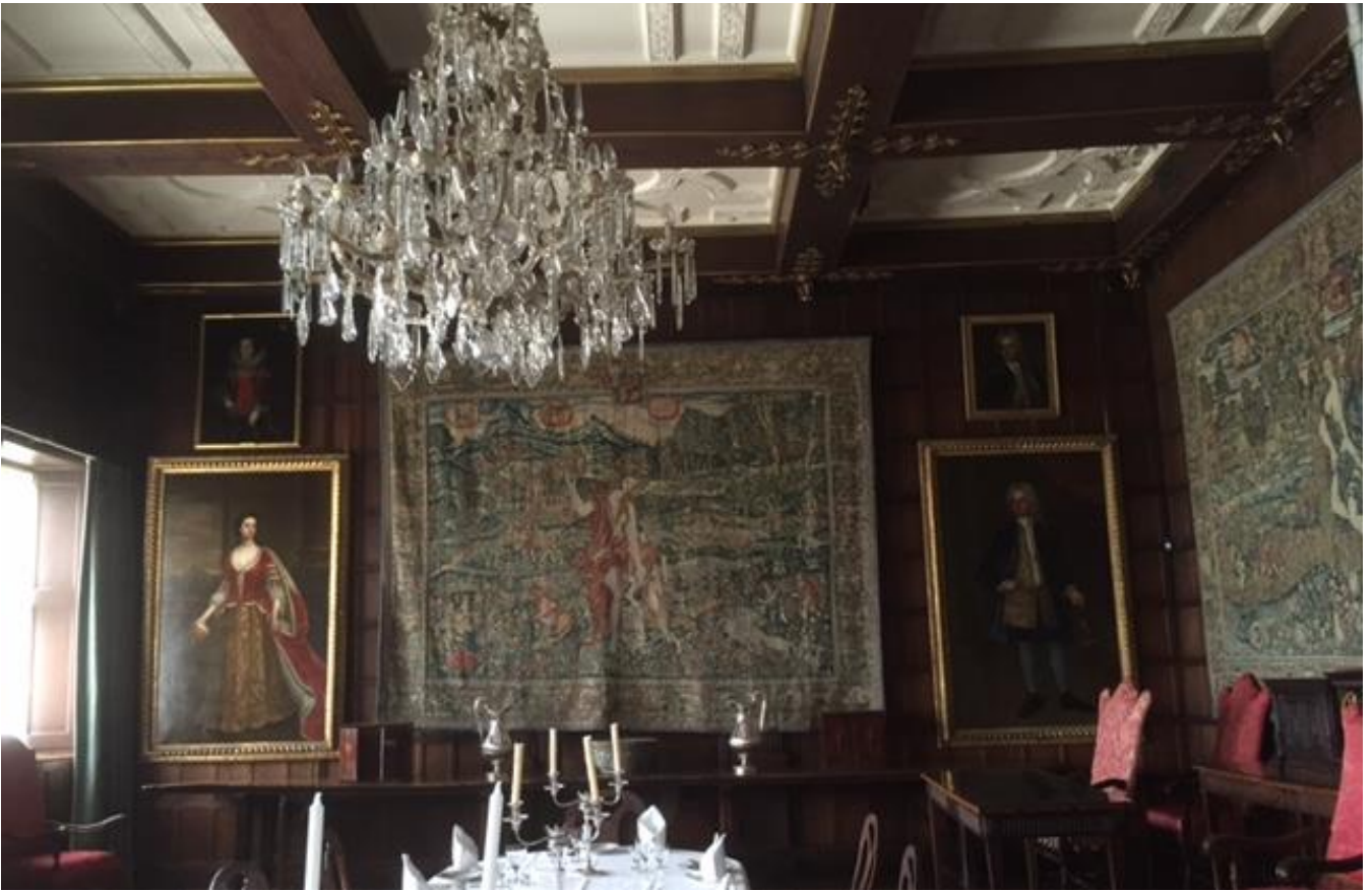
The Winter Dining Room: After fibre optic lighting is installed